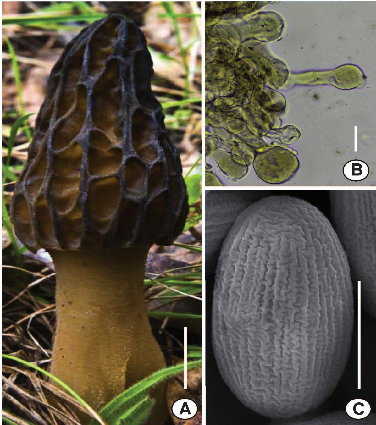
FIG. 2. Morchella australiana . A–C. A. Habit photo of holotype collection in mixed Eucalyptus and Callistris forest 7 km N of Bugaldie in NSW. B. Capitate elements on sterile ridge. C. Ascospore with irregular longitudinal and interconnecting transverse ridges. Bars: A = 2 cm, B = 25 \mu m. C = 10 \mu m.